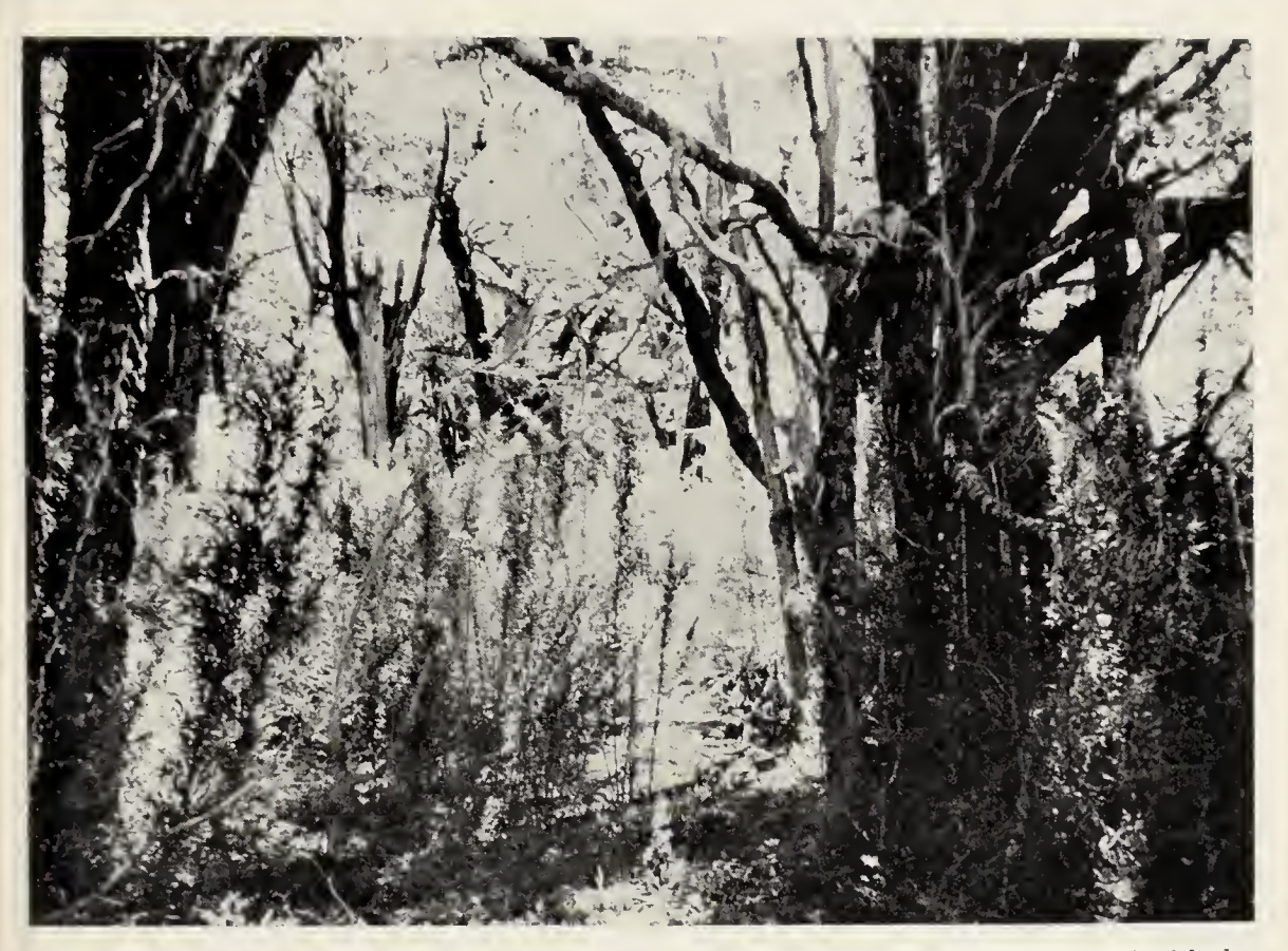
FIG. 6. The interior of the mature Nothofagus forest shown in Figure 5. Amid the large trees with draped mosses and a bamboo understory is the nest cavity (in palebarked tree above bamboo, left center) of a pair of Magellanic Woodpeckers.

the birds tapped loudly, and deliberately, usually at one to four blows in a series. The sounds of these blows are easily distinguished from drum-taps by their irregular pattern, lesser resonance, and (usually) lesser intensity.